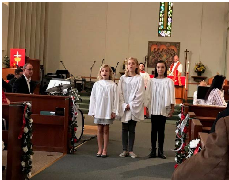
The "Children's Choir" sang with poise and soul rending beauty Amazing Grace—My Chains Are Gone. "