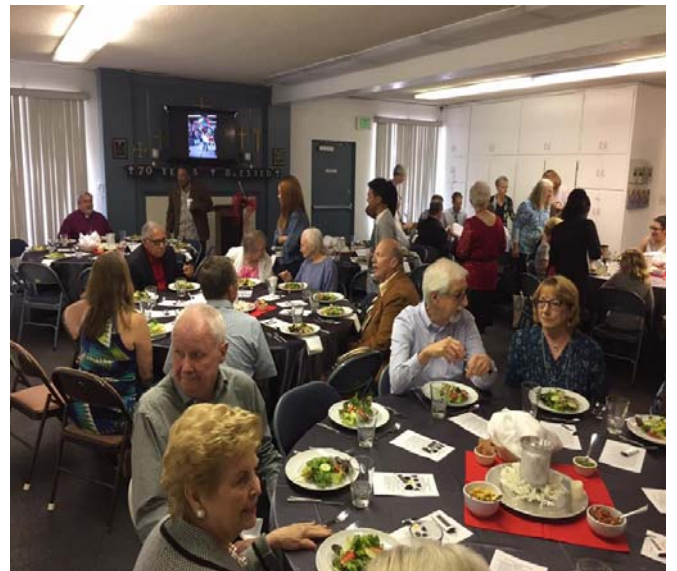
.....and everyone enjoyed the delicious luncheon!