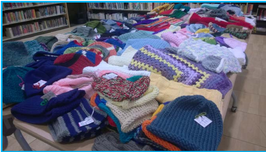
Thrivent Community Grant turned yarn into treasures

LWR Health Kits LWR School Kits Sock Drive Soles 4 Souls Hand knit caps, scarves, toiletries for Lutheran Maritime Ministry Food and Christmas Toys for Burbank Temporary Aid Center Collection of Education Labels, can pull tabs, bread squares and recyclables